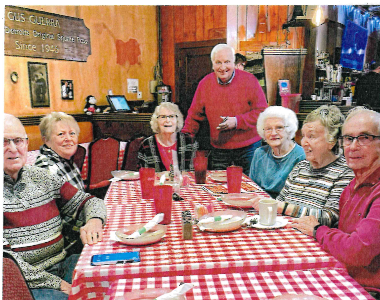
Pictured above are a few of the 20 CLC members who enjoyed lunch at Cloverleaf Pizza in East Pointe last month. Another outing is planned at the Mexican Village on Wednesday, March 14 at noon.